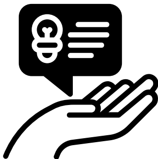
Practical Support & Advice