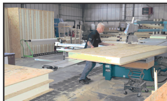
Made at our local factories in Eaton Socon

Get in touch with your local Manufacturer today to find out more