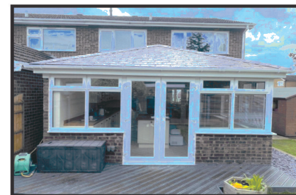
Additional new room to your home

Get in touch with your local Manufacturer today to find out more