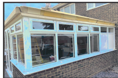
SIPs Panel Efficient Technology