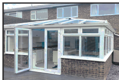
Inefficient wasted room